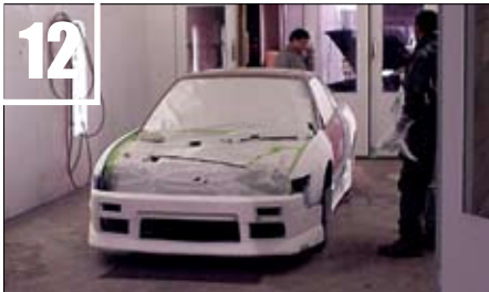
12 Inside the paint booth, the car is checked over one more time and any areas sticking out are taped up or covered.