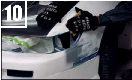
10 To prep the surface for paint, it needs to be sanded so it will stick on properly. Careful not to scratch the Carbon hood!