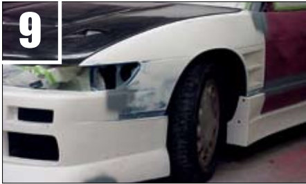
9 The most important aspect of a kit installation is the fitment between panels. As you can see, the Chargespeed kit, along with expert installation, fits nice and tight.