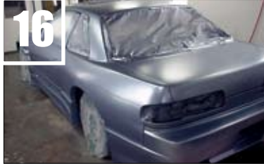
16 Drying and waiting to be put back together again.