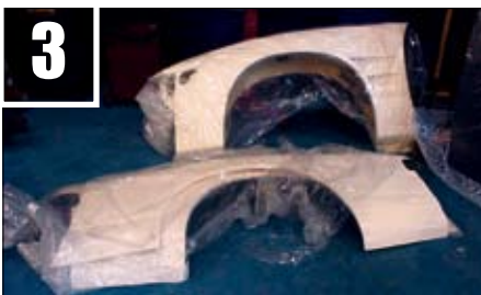
The wider front and rear fenders.