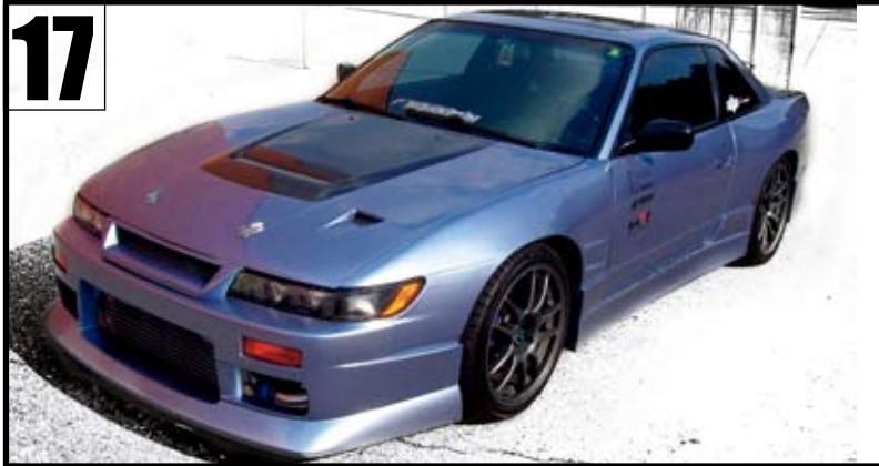
17 The end result, ready to turn heads and pulverize rubber. P&S