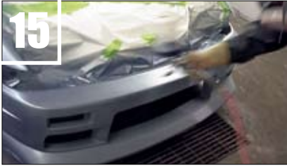
15 The front bumper and fenders are sprayed thoroughly.