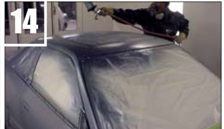
14 Finally, we can start spraying, from the top down, just like washing a car.