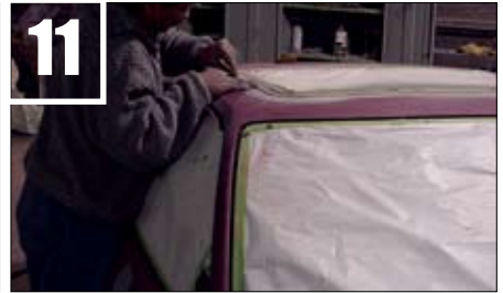
11 Sanding needs to happen everywhere on the shell, in a consistent pressure to prevent any pits. It is particularly labour intensive in tight areas, such as the perimeter of the sunroof.