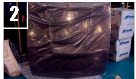
The Chargespeed Carbon Fibre hood that will grace our drift machine.