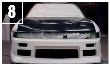
With the front bumper installed, the grille is covered up so the engine bay will have no unsightly overspray.