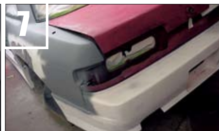
Whatever is easily removed and isn't wished to be sprayed in the blue paint, such as the taillights, are removed, leaving as much of the bare shell as possible.