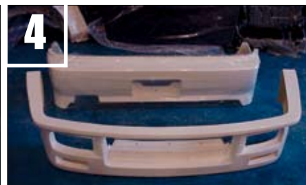
Chargespeed's front and rear bumper cover replacements.