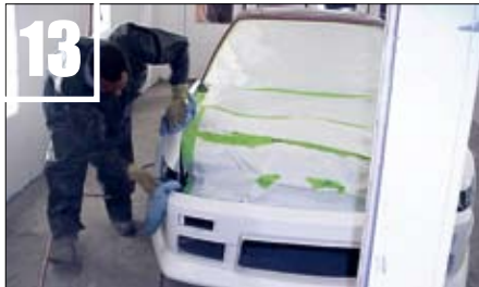
13 The car is gone over one more time with cloth to get rid of any dust sitting on the surface. The last thing you want is trapped dust particles ruining an otherwise perfect finish.