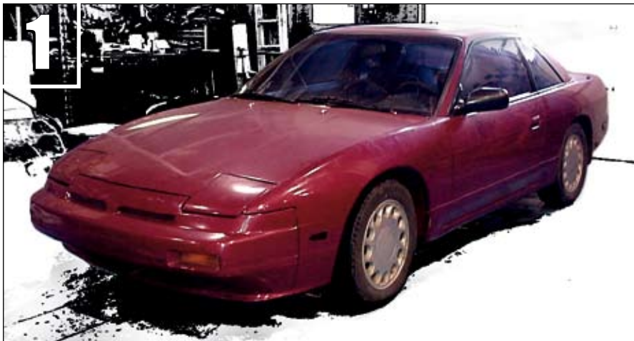
The stock car about to go under the knife.

Slide Junkie was left in the capable hands of International Automotive & Custom and Birchmount Collision for the fitment, installation and painting.