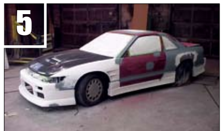
With the body kit fitted to the car and the fenders grafted on, it was time to prep it for paint.